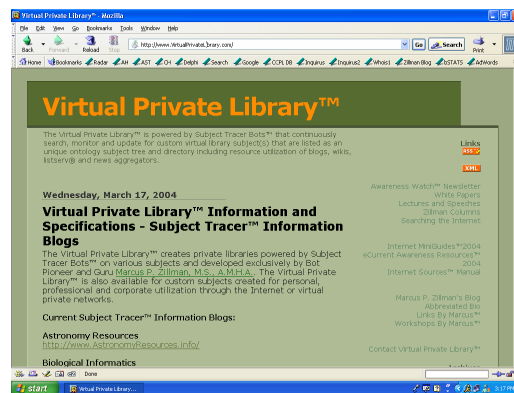
Figure 5 Virtual Private Library Subject Tracers