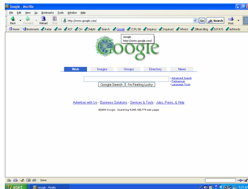
Figure 1 Google Search Engine