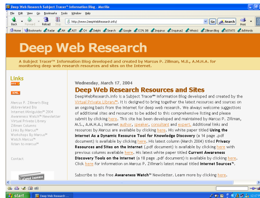
Figure 4 Deep Web Research Resource

Deep Web Research Article - LLRX http://snipurl.com/57jm